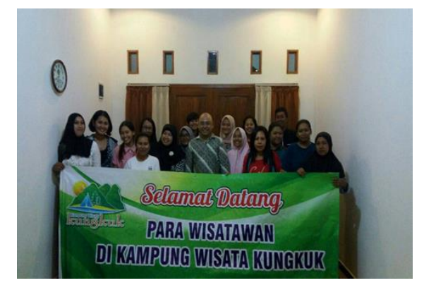
Figure 8. Badawis Staff and the local young people

The high commitment of all stakeholders in the tourism village, including the village chief officials, Pokdarwis, farmer groups, BKM, and Batu Guide Center (BGC) to work together to continue the activities of Tourism and language Awareness is autonomously associated with community development projects.