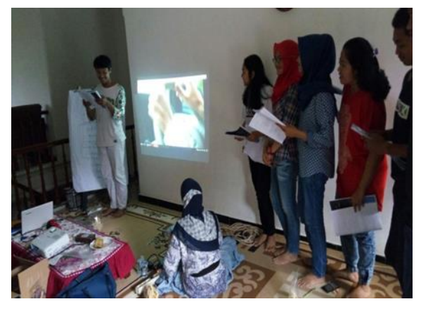
Figure 5. Practices on Product Presentation

In the language training, the participants learn how to present the product in English. They have to be able to apply the theories of product presentation and present it in front of their friends. The other participants give questions and comments on the related presentation. Figure 5 shows the training process.