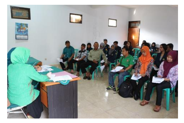
Figure 1. Gathering and Discussion on the BADAWIS program

In planning, a series of activities such as making an appointment with the contact person, preparing the modules and teaching materials are prepared at this stage. The activities are conducted by inviting the two parties namely, a group of tourism awareness consisting of the youths, and a group of senior villagers involving strawberry, apple, orange farmers and some homestay owners. Figure 1 shows the dissemination of the program attended by the two parties.