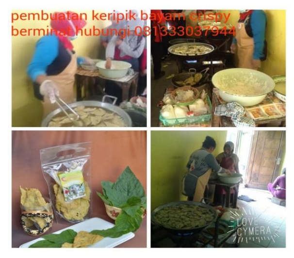
Figure 3. Process of Making Fruit Chips

Besides handling the guests, the participants also learn about presenting Batu products such as promoting fruit chips and designing a brochure. Figures 3 and 4 describe the activities respectively.