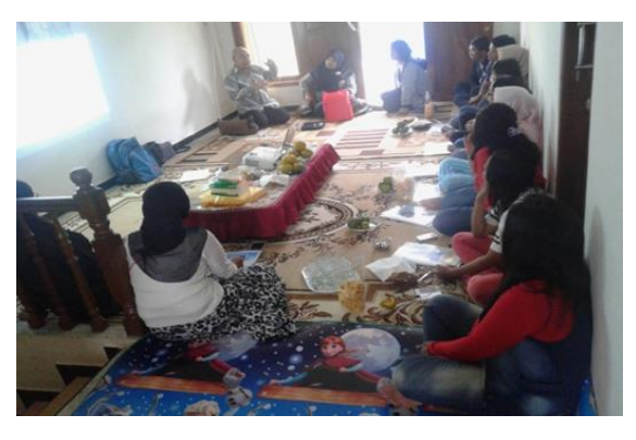
Figure 7. Activities in Brochure Making

In addition to designing the brochure, they have to able to present what is inside the brochure. Figure 7 shows the activity.