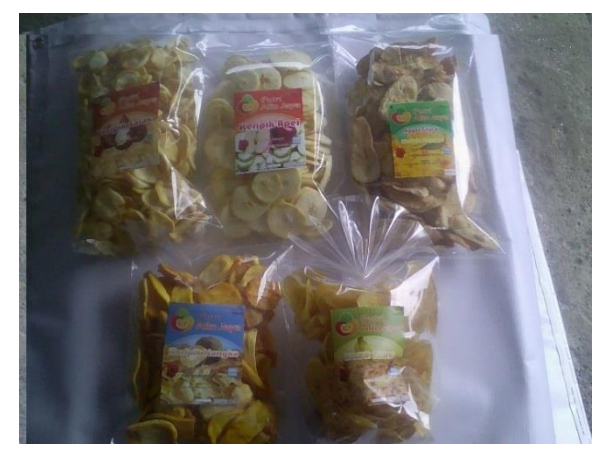
Figure 4. Fruit Chips in Different Packages