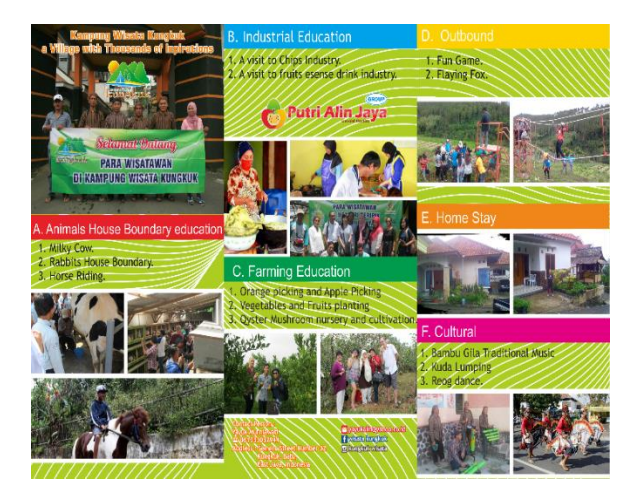
Figure 6. Sample of Brochure Made by Badawis Community

Besides product presentation, the participants were also trained to design a brochure introducing and promoting their own area of resources. Figure 6 shows the example of the brochure they have made.