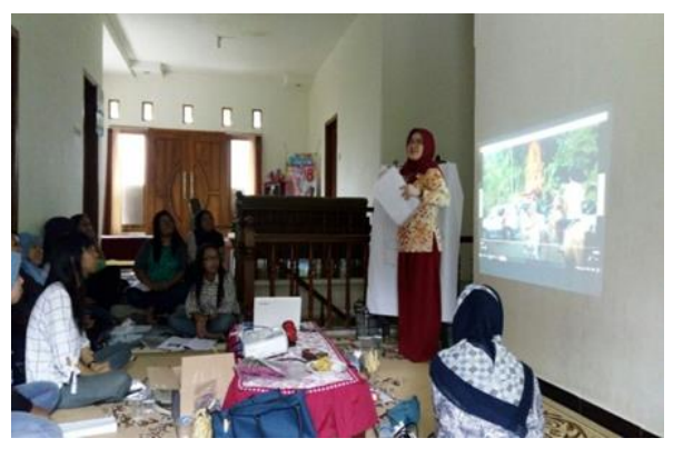
Figure 2. Activities on Handling the Guests

In Doing, the training was conducted with around twenty participants who enthusiastically join the program. Most of the participantas are the youths from Kungkuk village. Figure 2 describes the activities on handling the guests. After having some theories on handling the guests, all of the participants practice handling the guests in pairs.